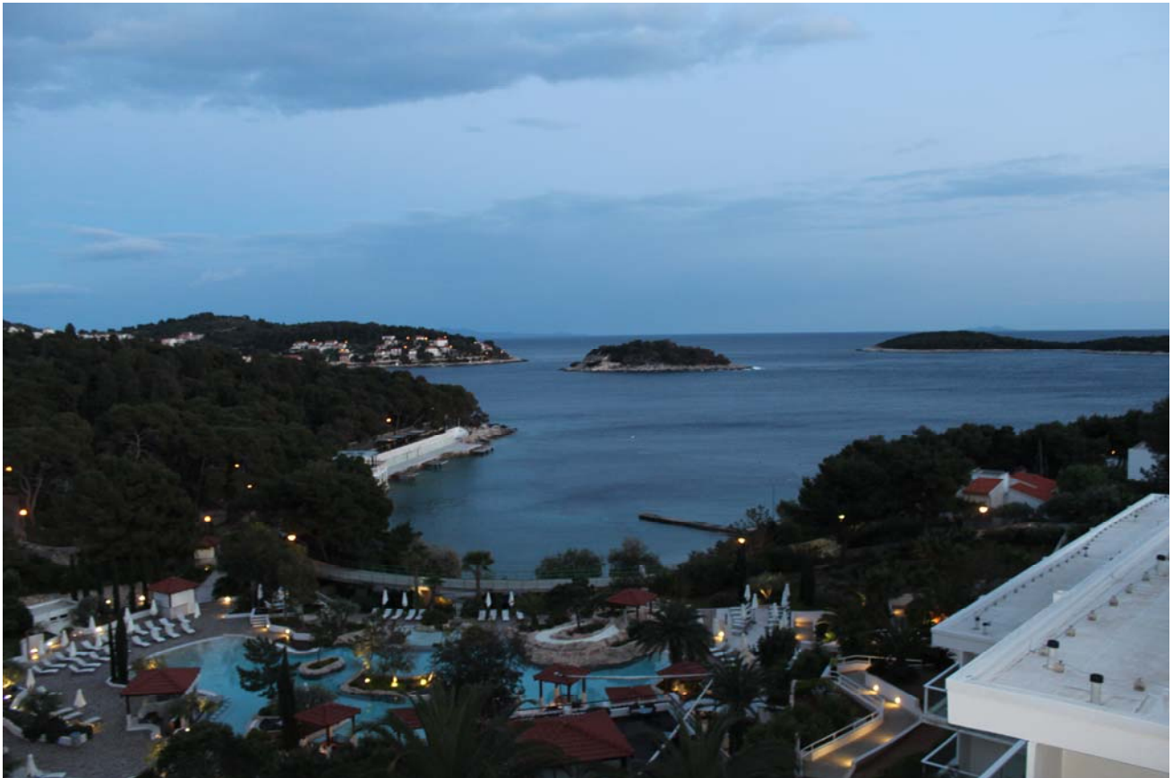
View from our Hotel Room in Hvar Town

Our hotel room in Hvar had a gorgeous ocean view of the Adriatic and Pakleni Islands. During the day we explored the little town on foot. We started the day by walking to the top of the old fort which sits above Hvar Town. From here we had a spectacular view of the town below with the red tile roofs and the Pakleni islands. After finishing our hike we wandered through the town and stopped at two cafes. The first was a little dessert cafe called Noncia Patisserie. We enjoyed our savory dessert and drinks before relocating to another cafe on the main pedestrian passage through town to relax and people watch. Our dinner at Divino was spectacular. We had a table right on the edge of the harbor over looking the Adriatic. We were able to watch the sunset as we ate our appetizers and drank local wine from the island. The staff was extremely accommodating and the food was delicious. At the end the dinner the restaurant staff treated us to some homemade grappa!