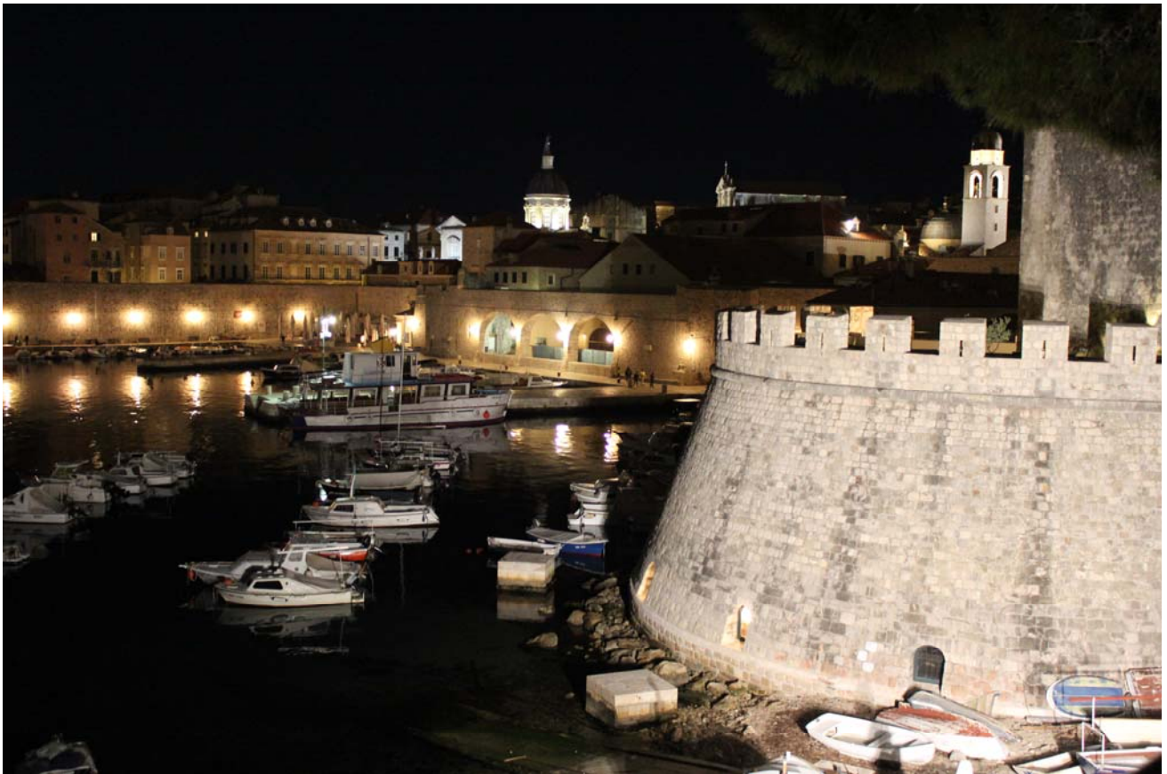
Our table was at the window in the foreground with the lights on