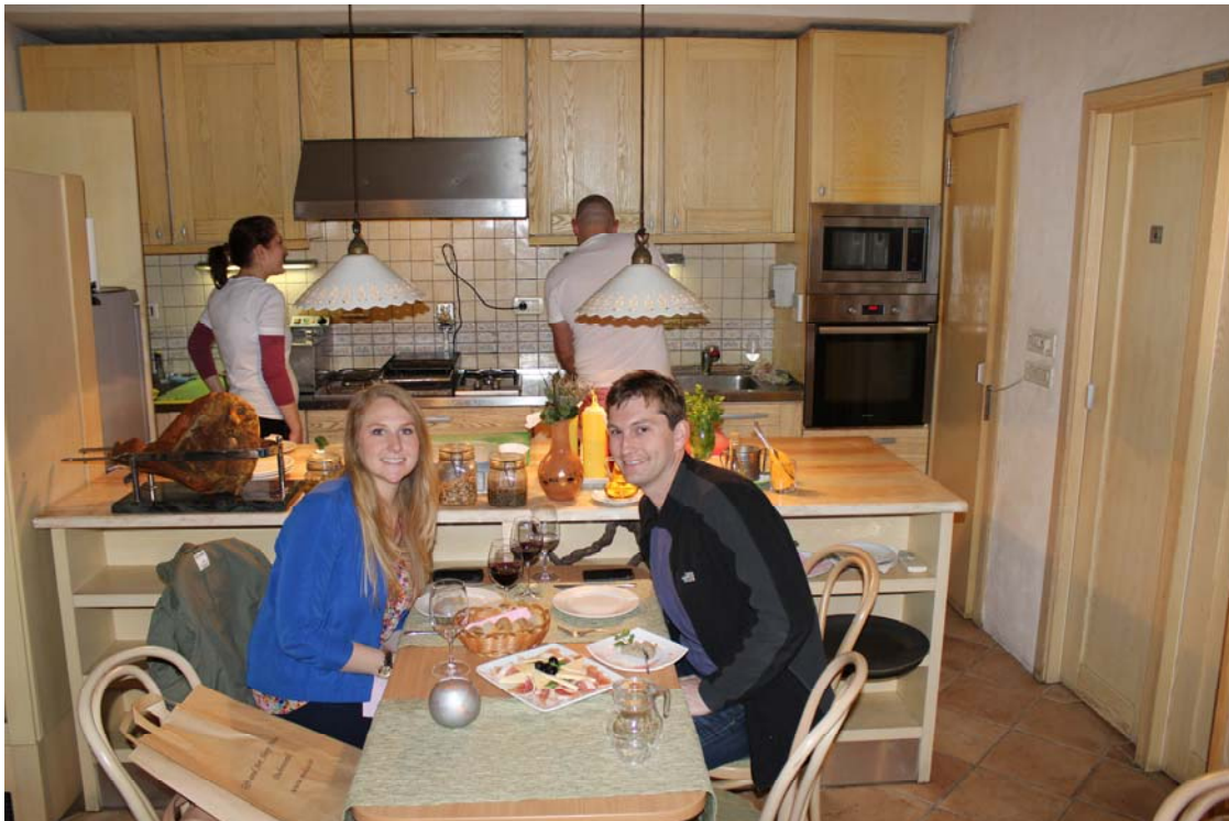
Dinner at Lucan Kantun

The staff at the Hotel Excelsior was extremely friendly and accommodating. They catered to all of our requests. We also had a couples massage arranged at the hotel spa. The massage included a private room for two. Within the room were two massage tables, a shower and an extra large bathtub. Once the massages were completed the masseuse filled the bathtub for us and we enjoyed fruit, nuts and tea while relaxing in the tub. Throughout our stay in Dubrovnik we had a private tour of the Old Town which included walking the city walls. We found ourselves getting lost in the narrow streets of the city exploring all the shops, cafes and restaurants. Some of our favorite places were Medusa, a gift shop with locally made affordable souvenirs and the restaurant Lucan Kantun where we sat adjacent to the kitchen and watched our meals being prepared just for us.