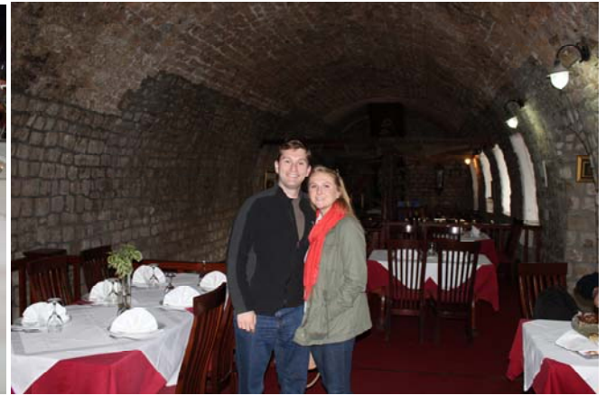
Seafood platter and Old Salt Dome at Bota Sare