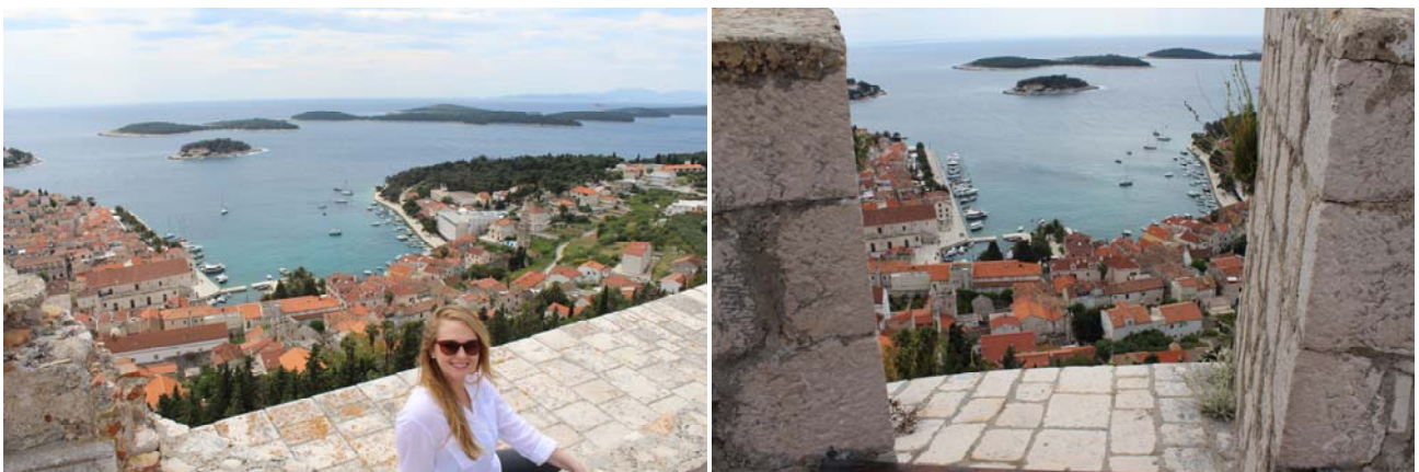
View from the Fort