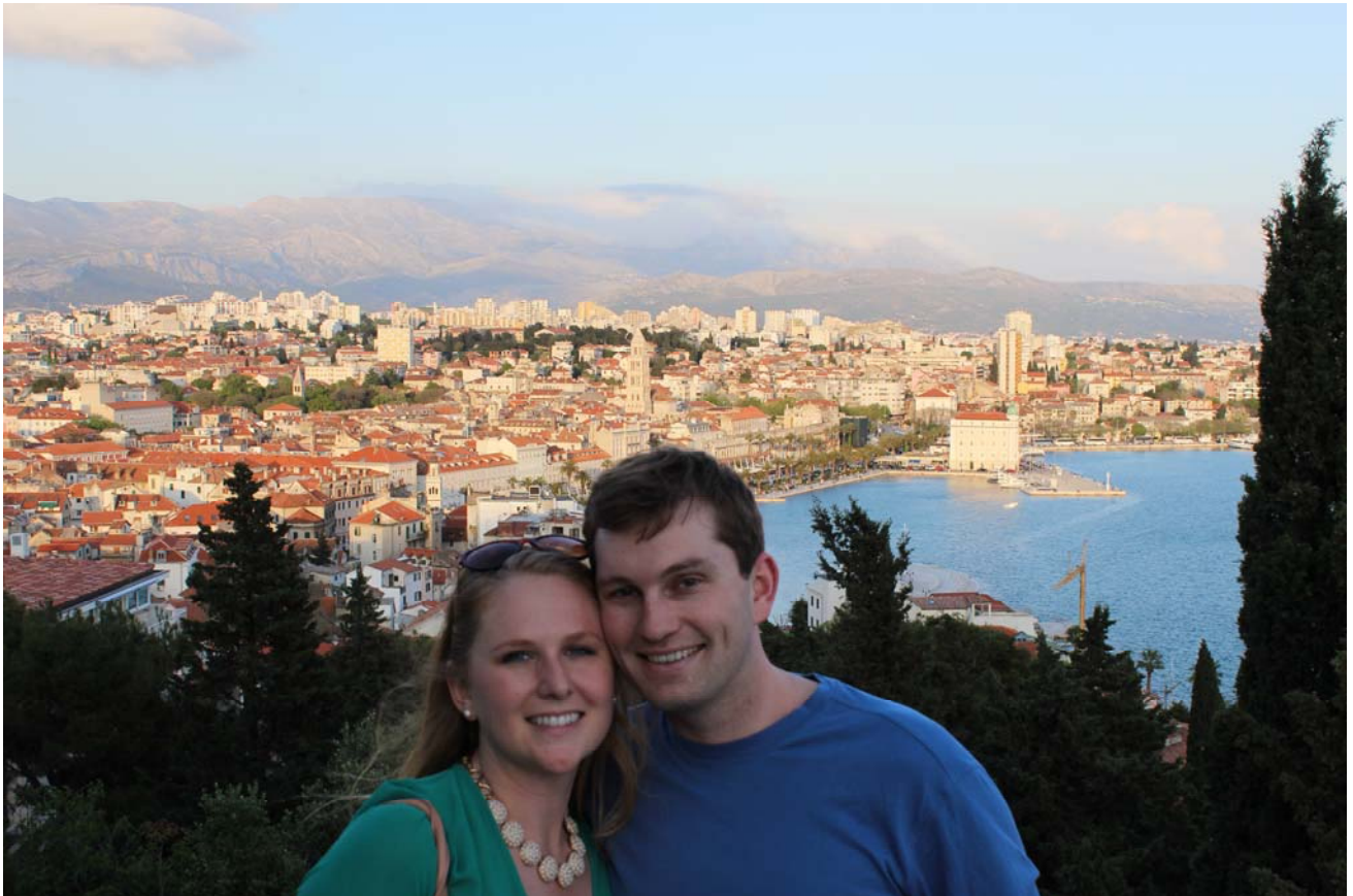
View from a Hilltop of Split