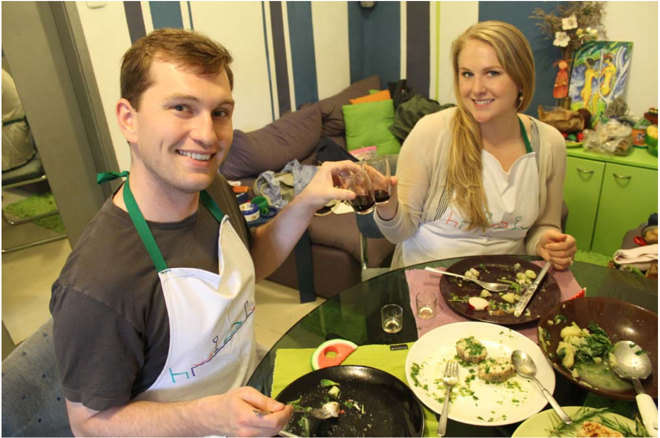
Cooking Class: Preparing our Dalmatian cuisine