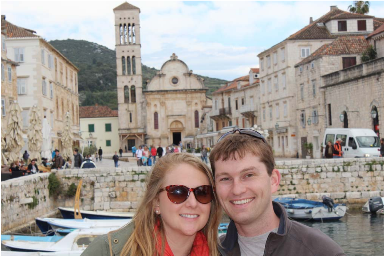
Enjoying Hvar Town