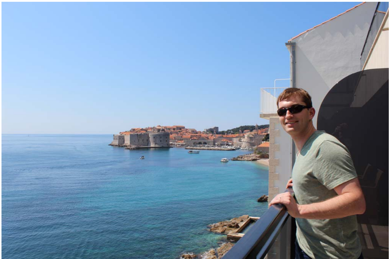
View from our room at Hotel Excelsior

Once we landed in Dubrovnik and we were transported to the fabulous Hotel Excelsior. Upon walking into our room we were welcomed with chocolate covered strawberries, champagne and a picturesque view of the blue Adriatic Sea and the walls of old Dubrovnik. After a quick nap we ventured into old town Dubrovnik and stumbled upon Restaurant 360 degrees which is built into the walls of the city. When we arrived we requested the gun chambers per recommendations from Pamela. We had no idea what we were in for but we were taken away to a private area of the restaurant. We were informed the gun chambers used to store cannons and ammunition to protect the old town. Sitting in our private gun chamber we awed by the view of the harbor from the tiny window and the friendly wait staff that served amazing food and wine all night. It was a perfect first meal alone as a married couple.