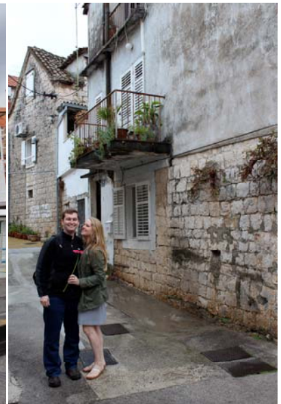
Walking through the streets of Trogir