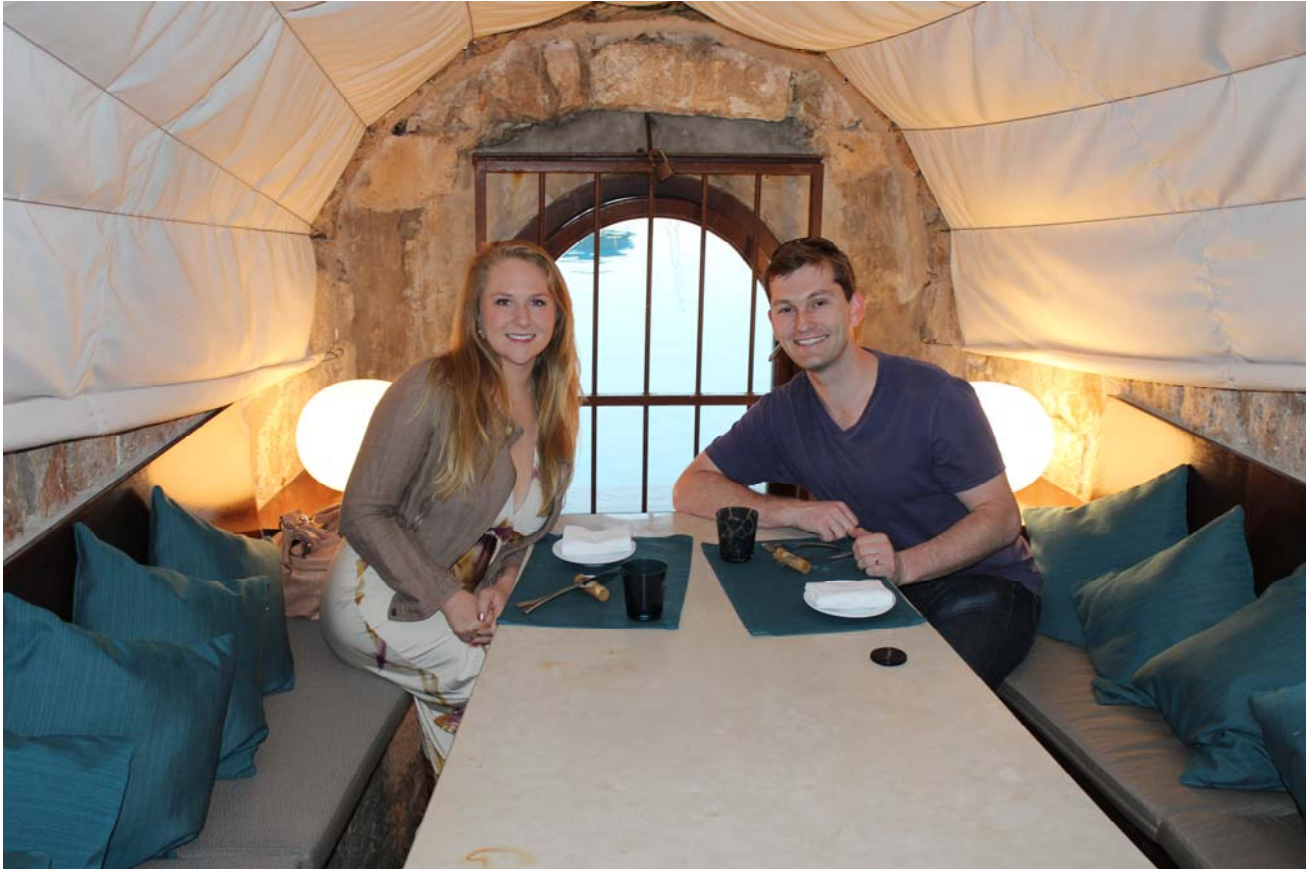
Our table in the gun chamber at 360 Degrees