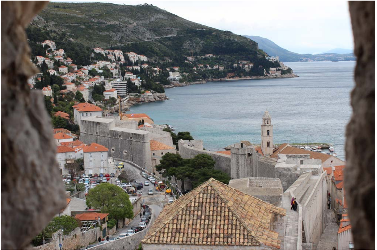
Walking the city walls